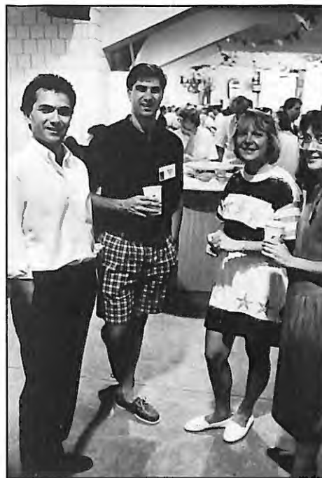
Alumni at Bisons game.