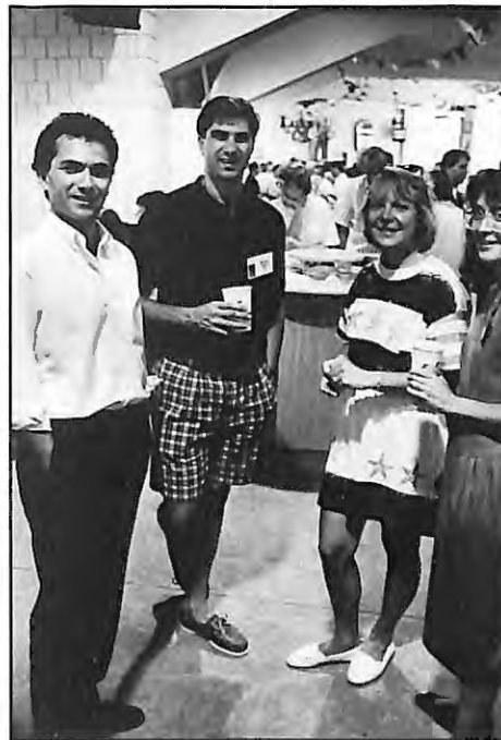
Alumnilae at Bisons game.